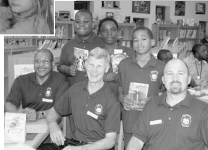
Volunteers from Shields Elementary and Longfellow Schools enjoy the end of the school year celebrations with their students.