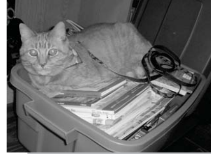
Oliver, our feline mentor, takes a break while returning books to the office with his Volunteer Coordinator at Carrollton Elementary School.